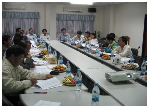
Figure 1: Participators of the Workshop